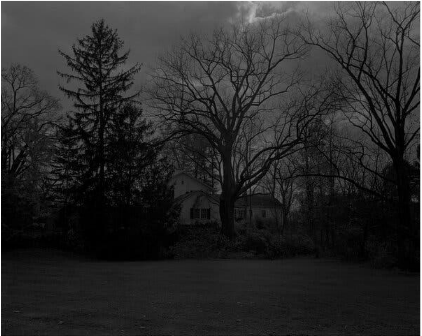
Dawoud Bey photographed sites that may have been routes for the enslaved seeking freedom in his 2017 series “Night Coming Tenderly, Black,” including this image, “Untitled #14 (Site of John Brown’s Tannery).”

And then there is “Mixed Blessing,” a 2011 sculpture by the Anishinaabe artist Rebecca Belmore, who uses a hoodie and synthetic hair to create a prone figure, its tresses fanning around it on the floor like bird feathers. Its outstretched arms can be read as a gesture of prayer, gratitude, or submission to punishment — a complicated mix that simultaneously expresses cultural pride and sorrow for the violence visited on Indigenous people.