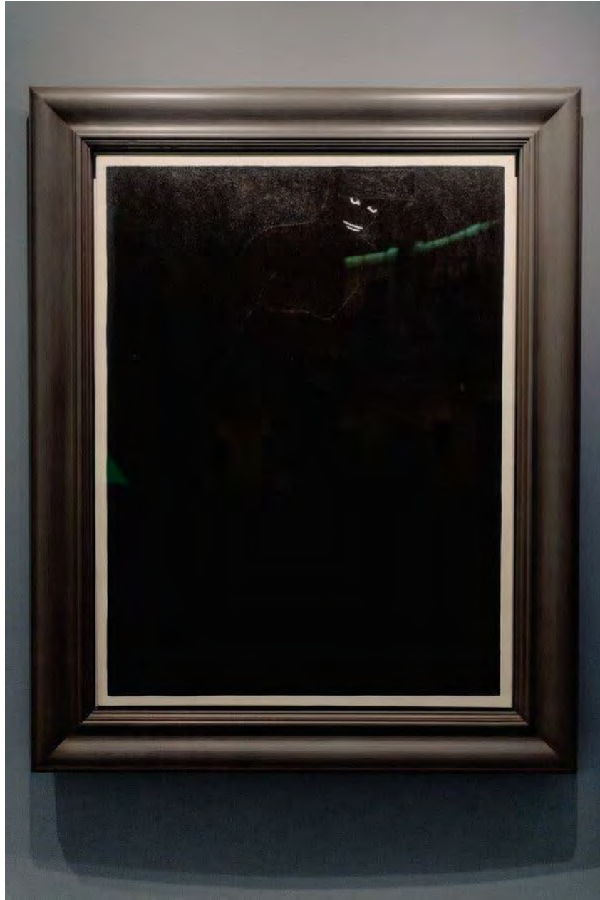
In Kerry James Marshall's "Invisible Man" (1986), inspired by Ralph Ellison's 1952 novel, the painter equates invisibility with black paint.