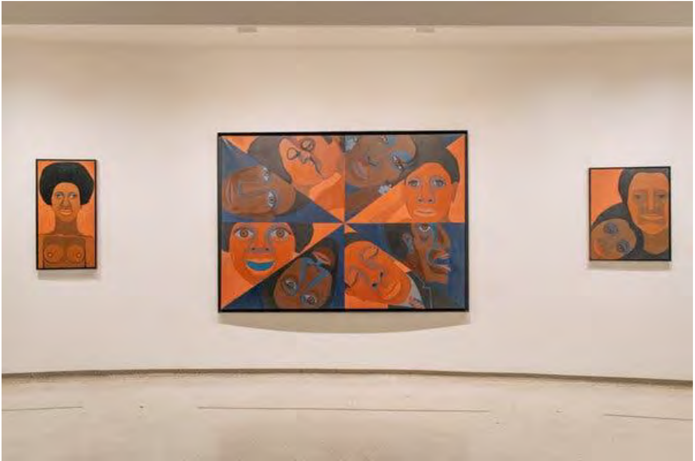
Faith Ringgold's "Black Light" canvases of the late 1960s: from left, "Black Light Series #3: Soul Sister," 1967; "Black Light Series #11: US America Black," 1957; and "Black Light Series #4: Mommy and Daddy," 1969.