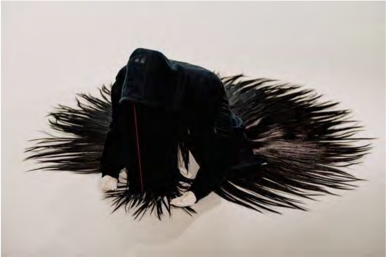
The Canadian artist Rebecca Belmore, a member of the Lac Seul First Nation (Anishinaabe), takes up the image of the hoodie in her sculpture, in which hair fans out like bird's feathers around a figure who bends over in supplication or prayer.

Spoiler alert: If you look up toward the museum's oculus you will see a mysterious black orb hanging down. It contains multiple cameras. Halfway up the rotunda, you'll be offered the option of ceding your phone to an attendant and entering a makeshift theater where you can view live feeds from those cameras of what's happening in the museum, processed through an A.I. program used by museums for security purposes. Watch closely and you'll notice the technology's occasional glitches — it sometimes misidentifies artworks as human, presumably because it can't tell the difference between an image of a body in an artwork from a sentient one. (Kind of perfect, given the show's theme.)