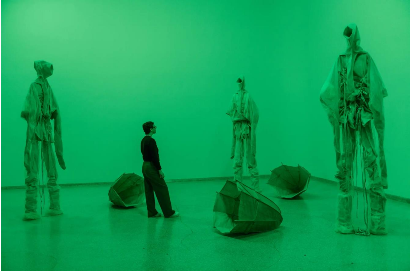
Sandra Mujinga’s “Spectral Keepers,” 2020, at the Guggenheim Museum. The green light has a paradoxical effect: It makes the figures harder to see.

In “Going Dark” at the Guggenheim, 28 artists explore urgent questions around what it means to be seen, and to see each other.