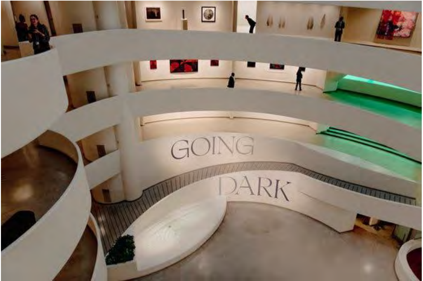
Installation view of “Going Dark” at the Guggenheim, featuring the work of 28 artists who explore the question of what it means, especially for people of color, to be subject to increased surveillance yet at the same time erased from the field of vision, forgotten in the social landscape.

Mujinga’s work is a fitting introduction to a show that asks what it means to be seen, and to see each other, especially when seeing takes place across racial and other forms of difference. What does it mean, especially for people of color, to be hyper-visible and subject to increased surveillance, while at the same time erased from the field of vision, forgotten in the social and political landscape? How does looking at each other through these layers of stereotyping and misunderstanding distort our perception of the world? If being visible is a trap, is there solace to be found in near-invisibility?