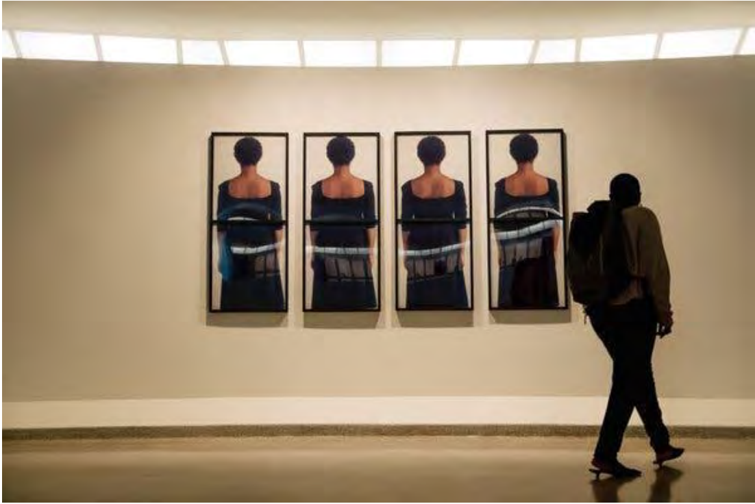
Lorna Simpson's work from the late 1980s and 1990s, such as "Time Piece" (1990), laid the groundwork for much of the conceptual approach in "Going Dark."